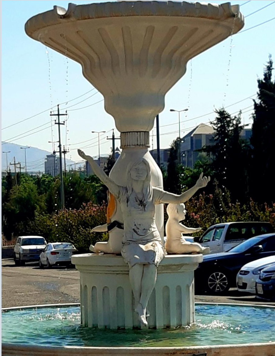
Fountain in front of the Ministry of Health in Duhok, Kurdish Region of Iraq